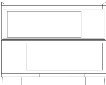
Width view 800 mm